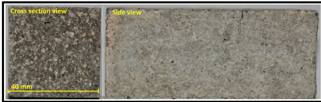
Figure 3. High definition cross section and side views of M 2 sample at 7-day curing (with CF).