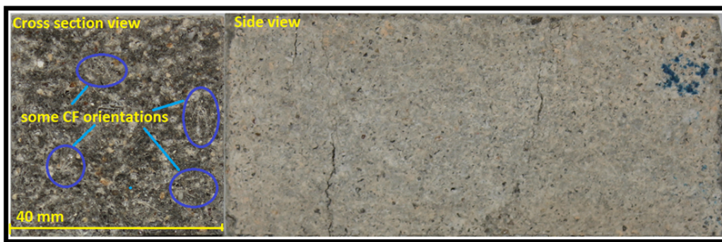
Figure 4. High definition cross section and side views of M 6 sample at 7-day curing (with CF).