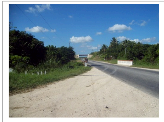
Figure 2. View of Segment 4

Valuation. It is necessary to wait for a period of time after the corrective measures have been implemented in order to quantify the accident performance in the segment; this was not possible within this study.