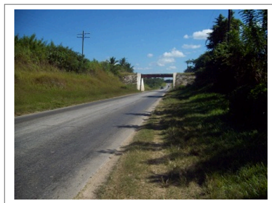
Figure 3. Views of Segment 4